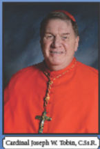
Cardinal Joseph W. Tobin, C.Ss.R.