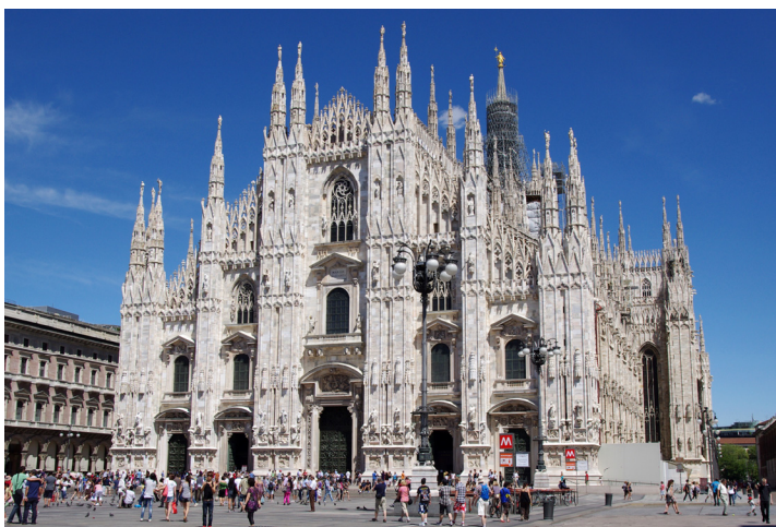
St. Charles Borromeo is interred in the crypt of the Duomo of Milan (Metropolitan Cathedral of the Nativity of Saint Mary).

In her concern for our salvation, our loving mother the Church uses this holy season to teach us through hymns, canticles and other forms of expression, of voice or ritual, used by the Holy Spirit. She shows us how grateful we should be for so great a blessing, and how to gain its benefit: our hearts should be as much prepared for the coming of Christ as if he were still to come into this world. The same lesson is given us for our imitation by the words and example of the holy men of the Old Testament.