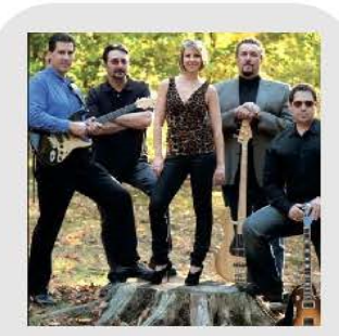
2/5ths Crazy Saturday June 10 7:30pm-10:00pm

For More Information: Call Parish Office at 908-245-1107 www.assumptionrp.com or Follow Us On Facebook