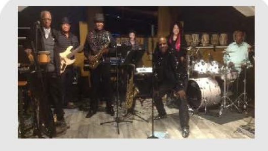
Diamonds in Jupiter Friday June 9 8:00pm-10:00pm

A special thank you to the Borough of Roselle Park!