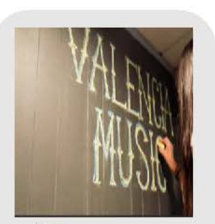
Valencia School of Music Thursday June 8 8:00pm-10:00pm