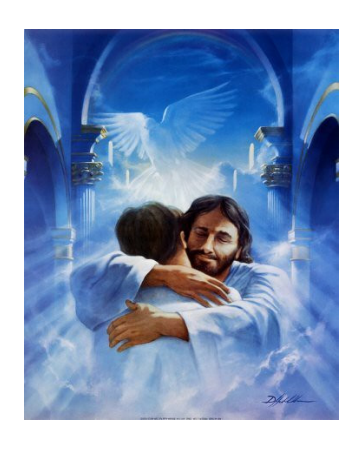
10<sup>th</sup> Eucharistic Congress July 17-12, 2024 in Indianapolis, Indiana